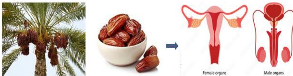
Figure: 2 Effects of date palm on male and female reproductive system.

The extensive use of the date palm in botany and medicine highlights its significance in promoting human health. Clinical studies have demonstrated various benefits associated with the date palm (28). The leaves, fruits, pits, and pollen of the plant have been used to prevent and treat diverse medical conditions (29). These components serve as the primary source of easily accessible bioactive compounds that are responsible for their biological activities. Historically, the date palm has been employed in addressing issues with the reproductive and endocrine systems. Figure 2 illustrates the impact of the date palm and its constituents on male and female reproductive systems. The potent antioxidant properties of date fruits are vital in enhancing fertility in both men and women (30).